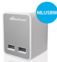
Dual USB Socket