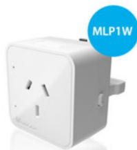
240V GPO Socket